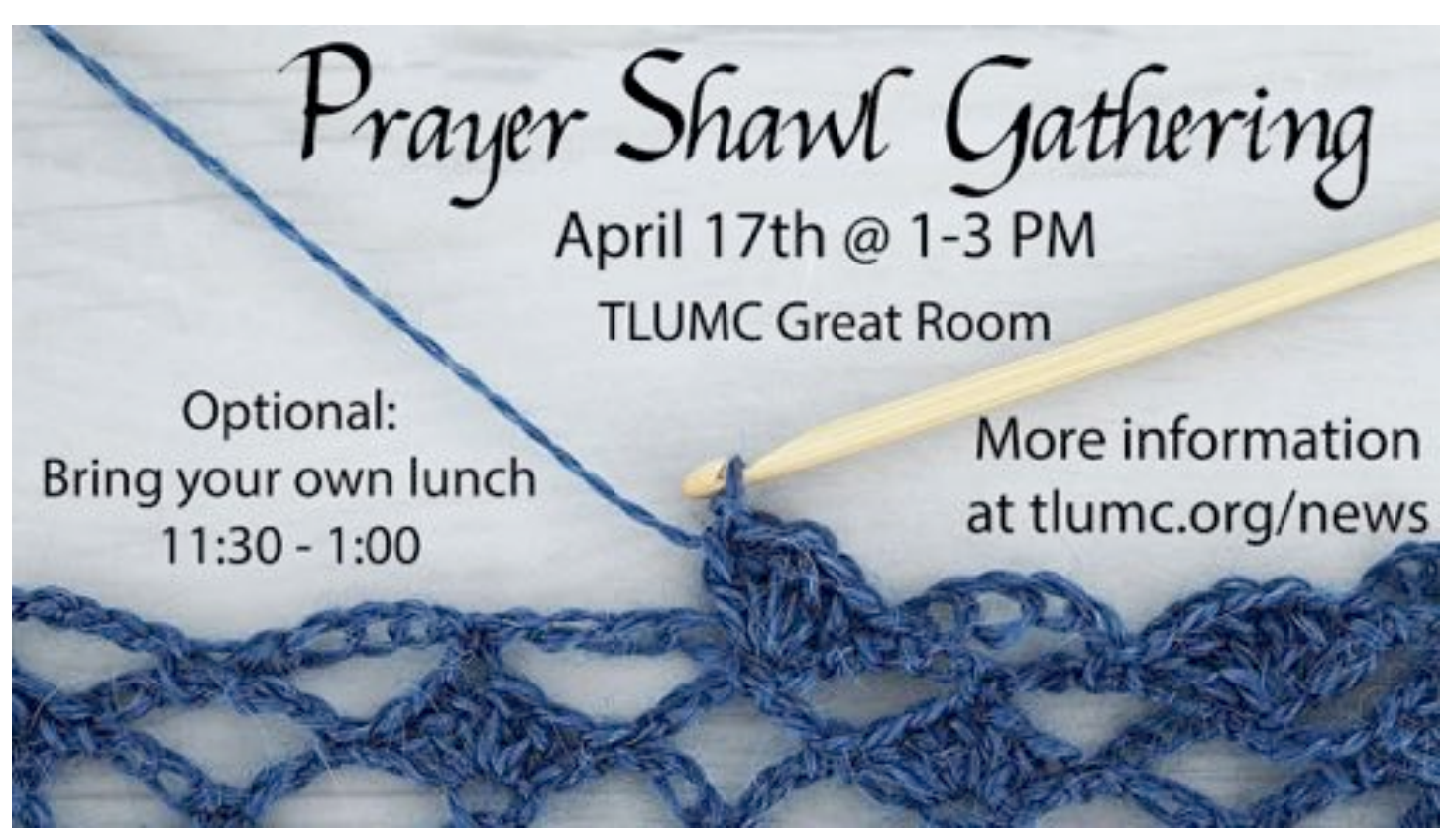
Tri-Lakes United Methodist Church Prayer Shawl Ministry 10th Anniversary Formally organized on April 2, 2008

The purpose is to provide anonymous shawl receivers a tangible "hug" from God and us, during difficult and joyful times. Our goal is for each TLUMC family/single unit to receive a Prayer Shawl. To date we have offered shawls to over 550 TLUMC families/singles, including a few special requests. We keep a list of recipients and treasure the few Thank You notes sent to our Prayer Shawl Ministry.